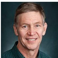
Frank Garry Veterinary Extension

"Causes and management of calf loss in north America"